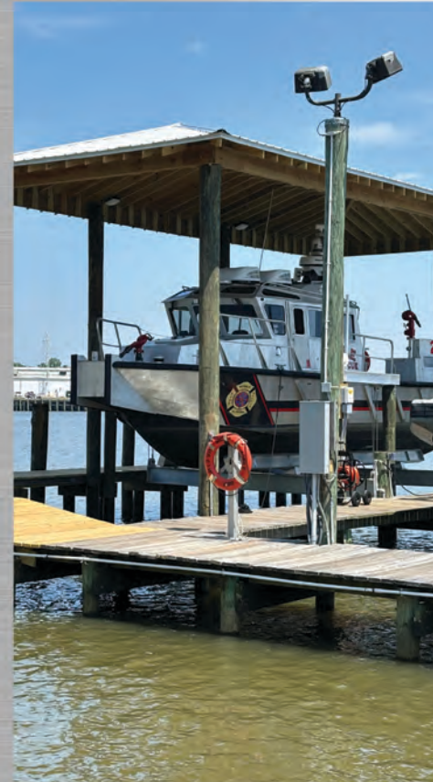
Client: Mobile Fire Department, Alabama Vessel: Steel Shark Product: 40k 8-post