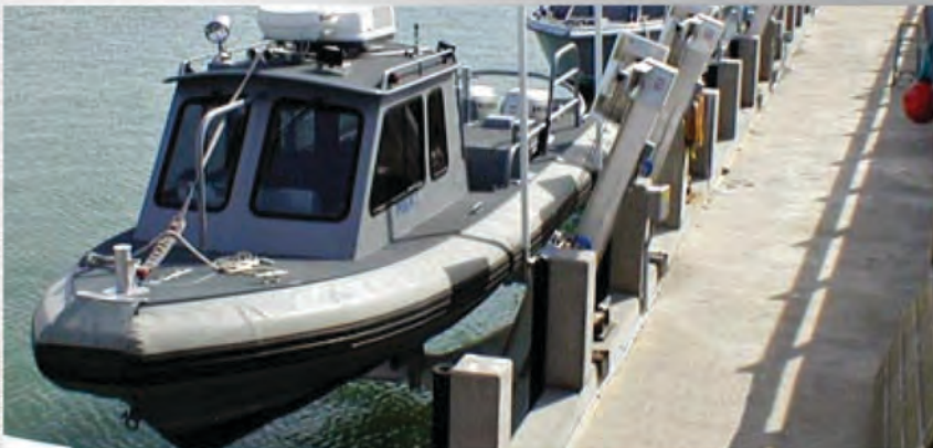
Client: Pulteney Fire NY Client: Texas Navy Base Product: Low profile 4- Product: (3) Elevator Lifts post boat lift with patented Sea Drive.