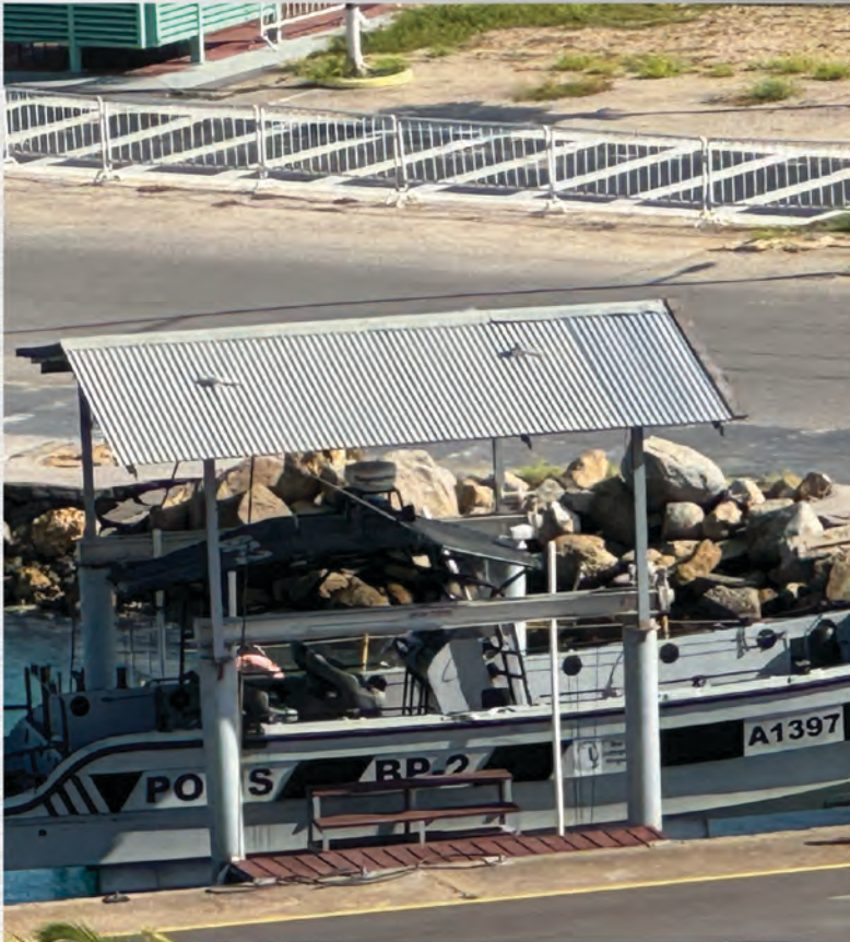
Client: Aruba Police Department Brief: We built a 4-post lift for the Aruba Police Department over ten years ago and it is still going strong and in use today, looking brand new.