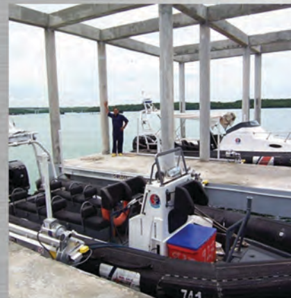
Client: Malaysian Police Department Product: (2) 2-motor profile lifts