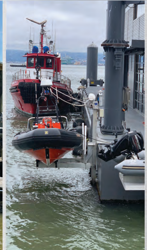
Client: San Francisco Fire Department Product: (2) Custom 3k Single-Track Elevators with platforms and aluminum bunks

Other municipalities: Virginia Beach Naval Base and more