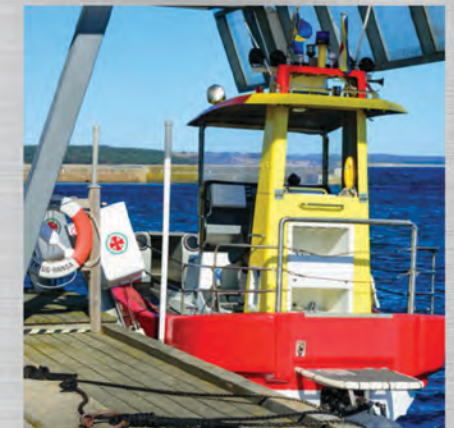
Client: Sweden Sea Rescue Product: Flat plate drive elevator