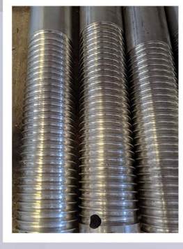
Solid Aluminum Deep Grooved Winder Shaft