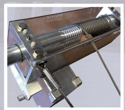
Box Construction for Drive Connection to Track Beam